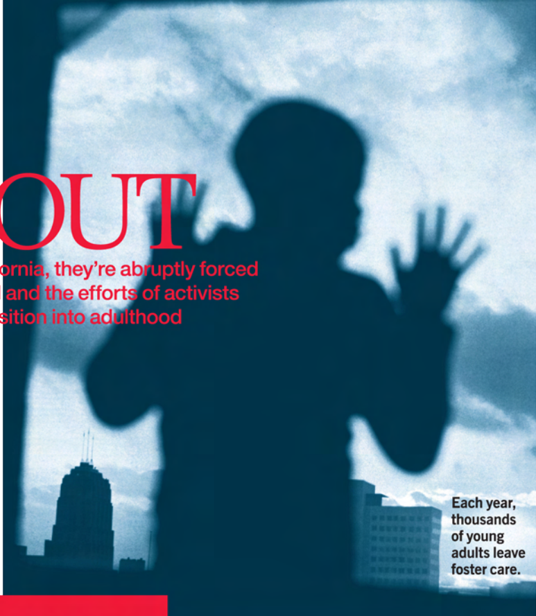
Each year, thousands of young adults leave foster care.